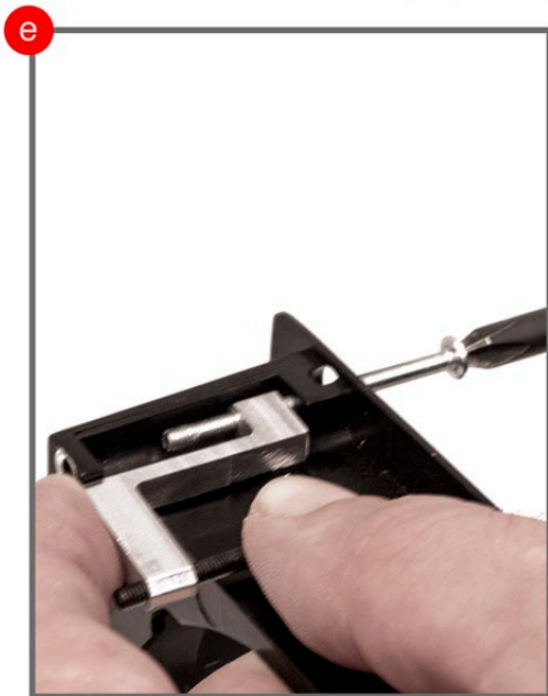
Step E- Align hole of new ceiling clamp with trim so screw can go thru to other side of trim.