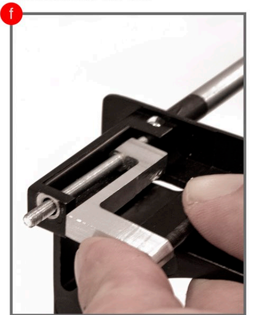
Step F- Thread clamp retaining screw completely to the end of the trim.