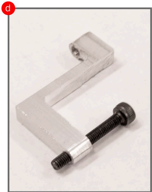
Step D- Closeup of new Extended Ceiling Clamp for thicker ceilings. Replaces standard clamps only when ceiling thickness is too thick for standard ceiling clamps.