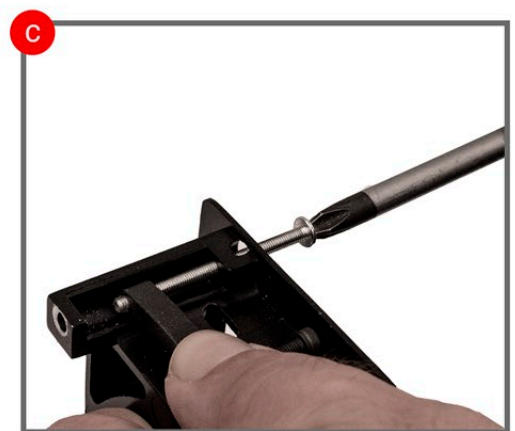
Step C- After push nut has been removed, clamp retaining screw and standard clamp can be removed from trim.