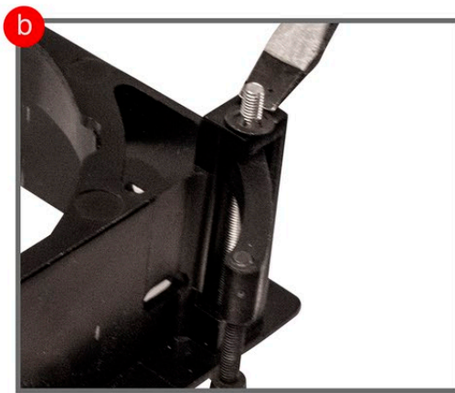
Step B- Push nut must be removed from clamp retaining screw with a flathead screwdriver or alternative tool (not provided)