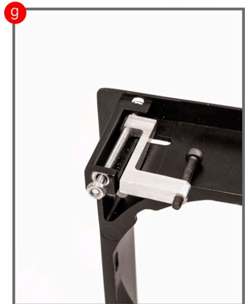
Step G- Add new locking nut