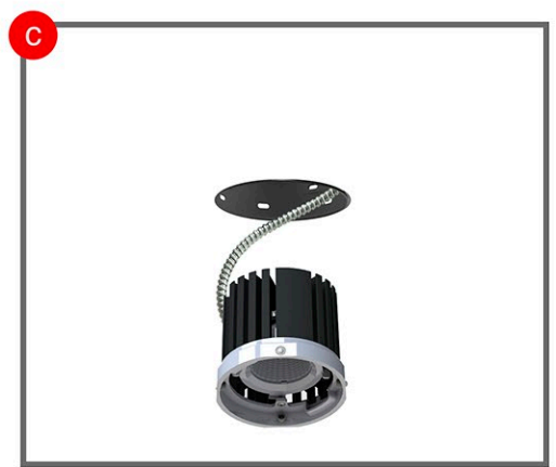
Step C- With power off, disconnect lamp assembly.