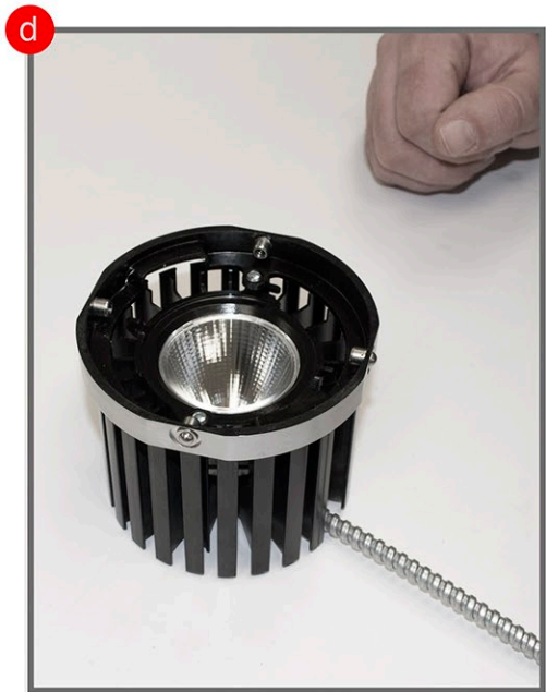
Step D- If possible, lay fixture on a flat surface reflector side up, to prevent pieces from falling out when disassembled.