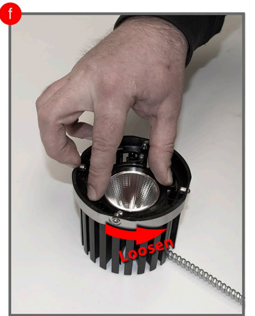
Step F- Turn Optics Retainer counter-clockwise till piece comes loose.