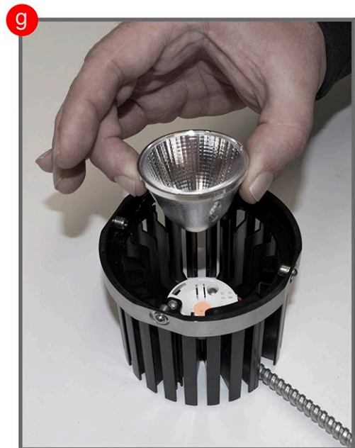
Step G- Remove Optical Retainer and then remove reflector.