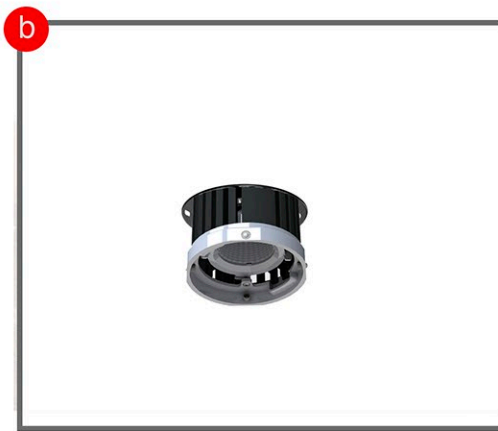
Step B- Remove lamp assembly. *Make sure to shut-off power to fixture.