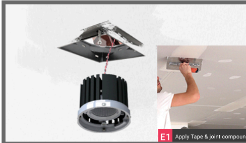
E Plaster receiver flange. Finish electrical