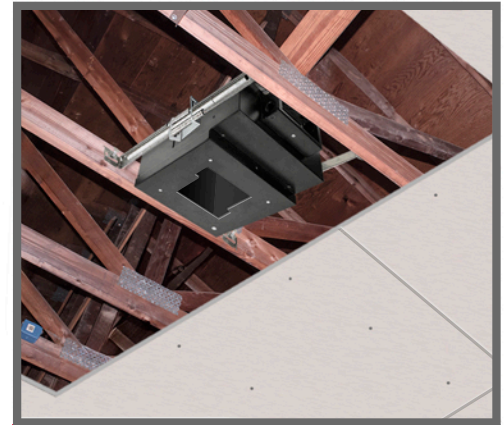
B Adjustable mounting rails anchor housing to ceiling joists with screws