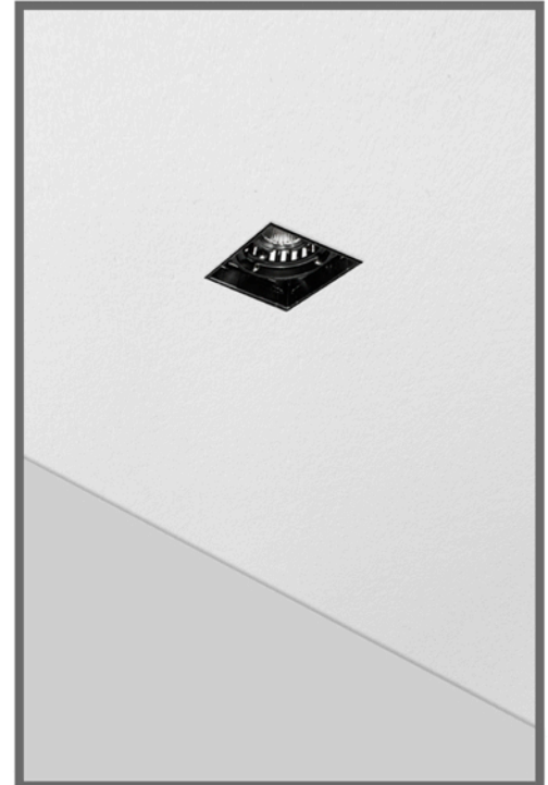
G After plaster ceiling has dried, paint over the plaster ceiling.