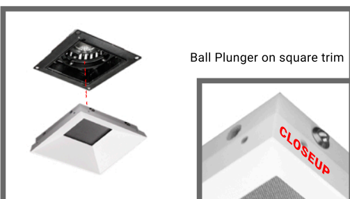
H Make sure trim ball plungers clicks into receiver to secure.