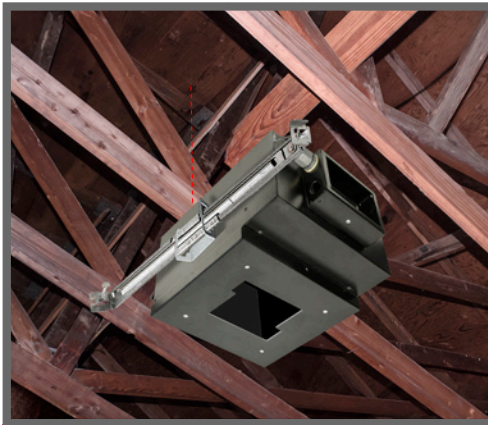
A Adjustable mounting rails anchor housing to ceiling joists with screws

DISCLAIMER: Screw and hardware on the outer edge of adjustable head are NOT to be tampered with. ANY adjustment WILL VOID warranty.