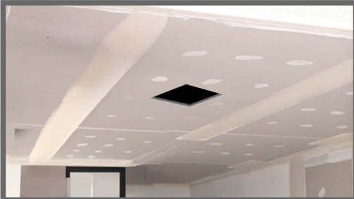
C Cutout opening for light install.