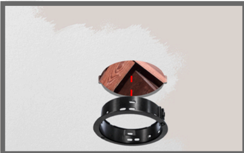
C Slide Flange receiver into opening.