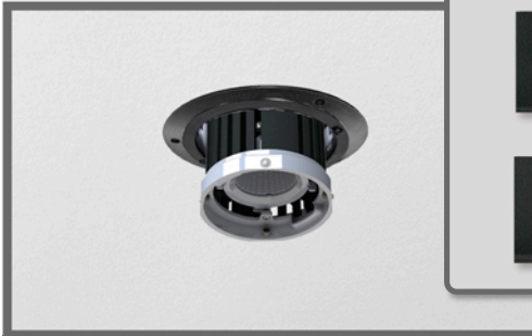
F Ball plungers(4) on light assembly clicks into 4 slots on receiver.