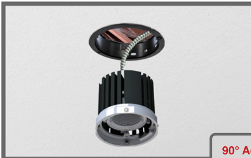
E Finalize electrical wiring/connections. Then slide light assembly into receiver.