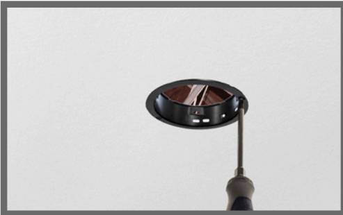
D Tighten screws to clamp receiver to ceiling