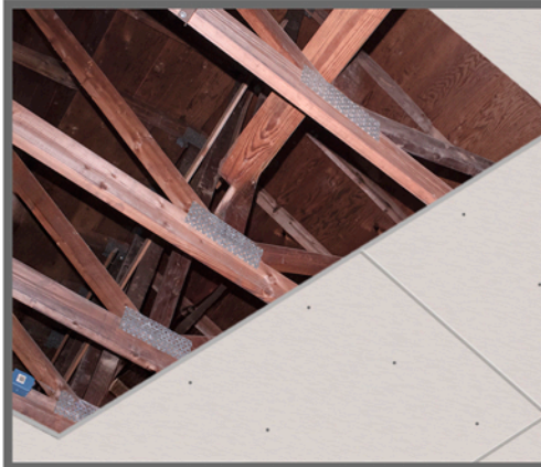
A Install ceiling.

DISCLAIMER: Screw and hardware on the outer edge of adjustable head are NOT to be tampered with. ANY adjustment WILL VOID warranty.