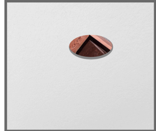
B Apply tape and joint compound. Cutout opening and prep for painting ceiling.