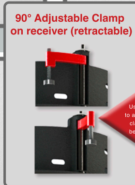
90° Adjustable Clamp on receiver (retractable)

CLOSEUP Use a Phillips screwdriver to adjust height of the ceiling clamp to secure a tight fit between GWB ceiling and light fixture.