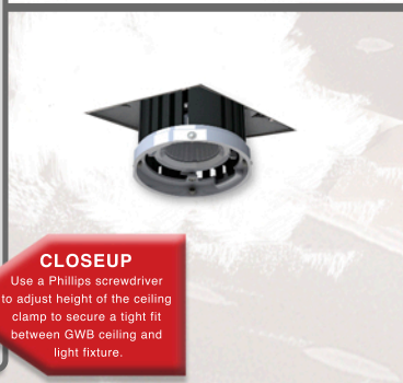
F Slide light assembly into receiver. Finish plastering GWB.