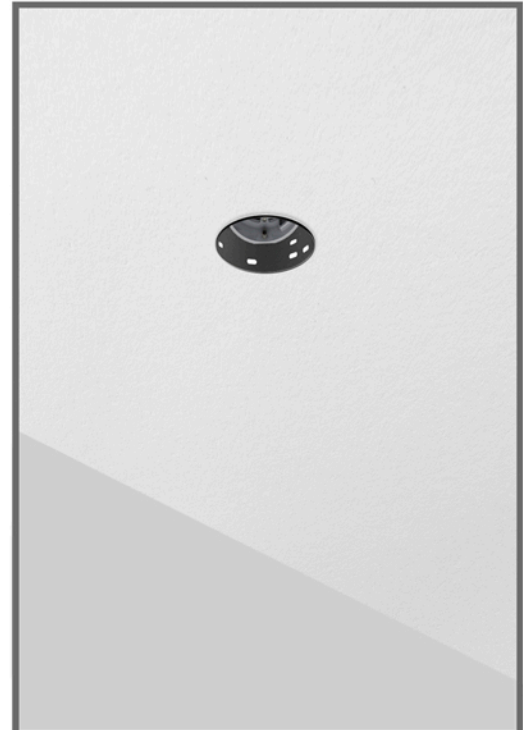
G After plaster ceiling has dried, paint over the plaster ceiling.