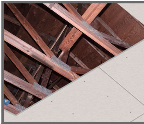
A Install Ceiling

DISCLAIMER: Screw and hardware on the outer edge of adjustable head are NOT to be tampered with. ANY adjustment WILL VOID warranty.