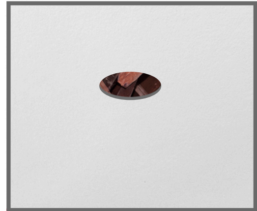
A Apply tape and joint compound. Cutout opening and prep ceiling for painting.