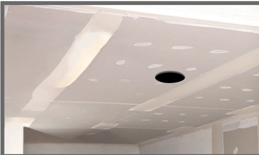
C Cutout opening for light install.