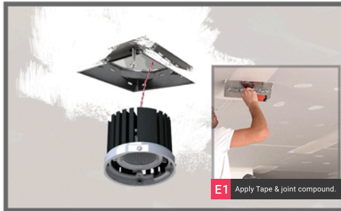
E Plaster receiver flange. Finish electrical